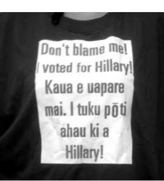
SHIRT BY ED SOBANSKY

● THE STYLE CONVERSATIONAL The Empress's weekly online column discusses each new contest and set of results. Check it out at wapo.st/conv1249.